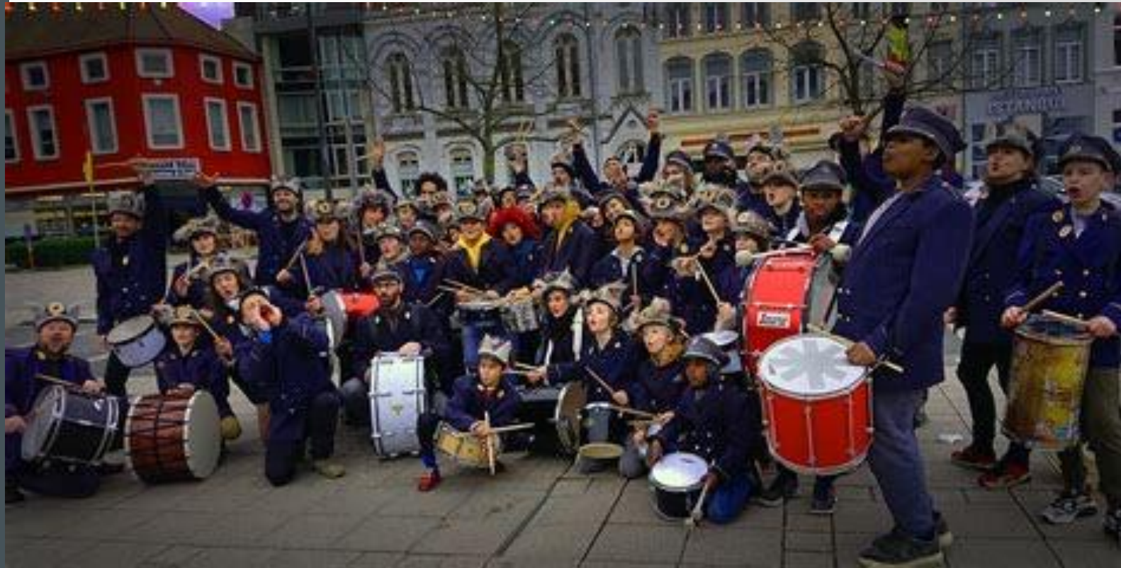
De Ledebirds, Gent