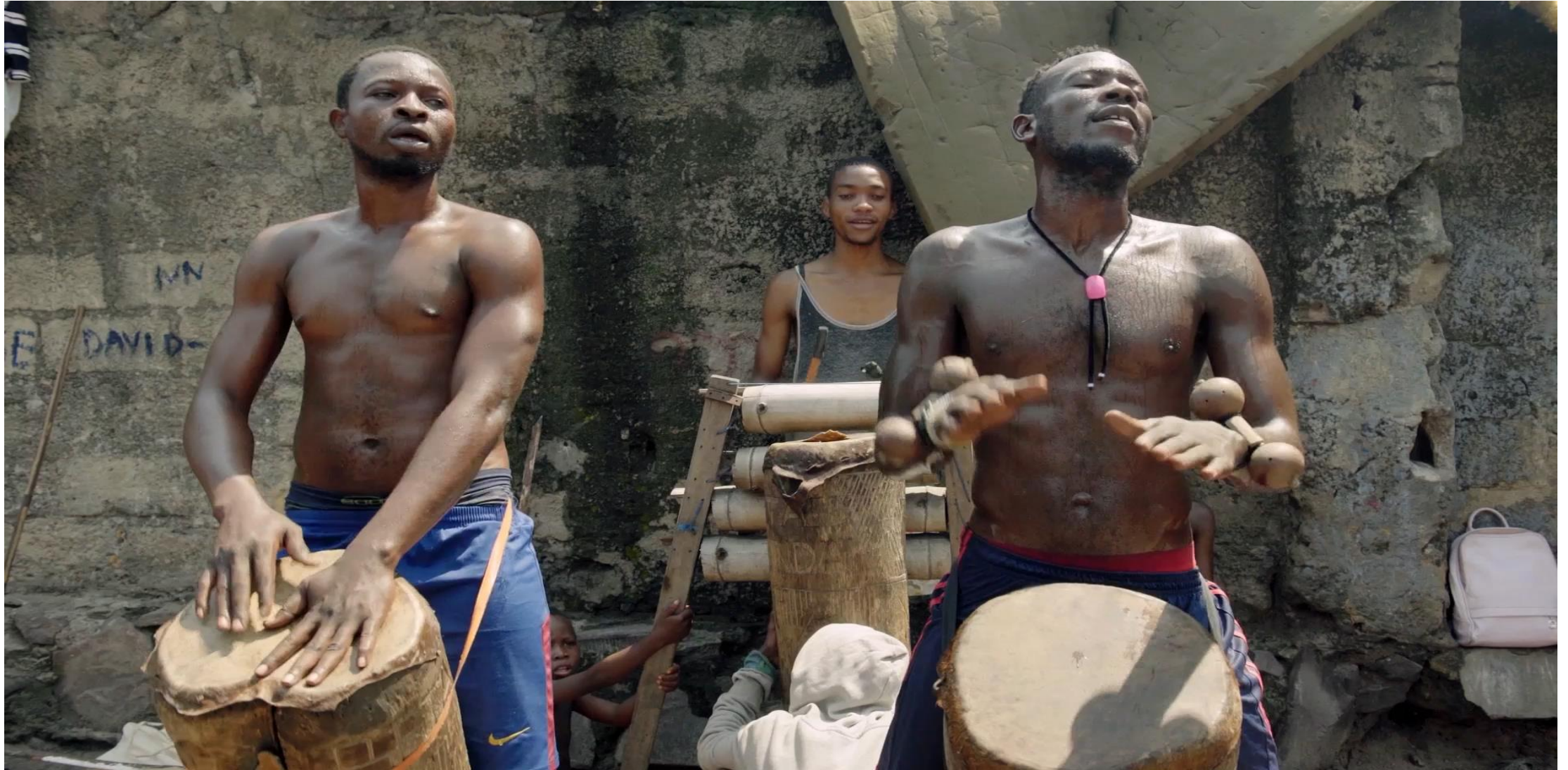
© Marie-Françoise Plissart (extract film 'Kinshasa Beta Mbonda', Alter Ego Films, 2019)