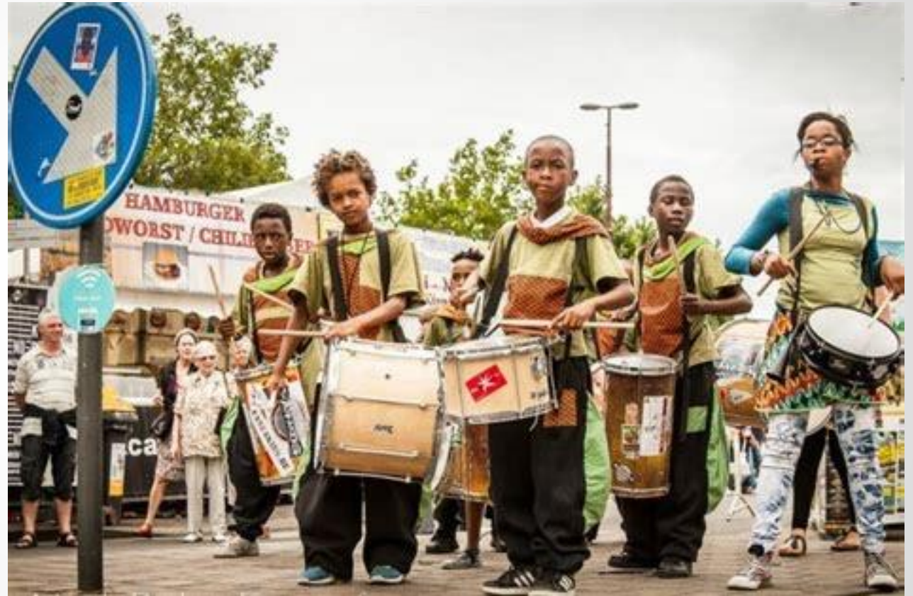
Fanfakids (Met-X, Brussels)