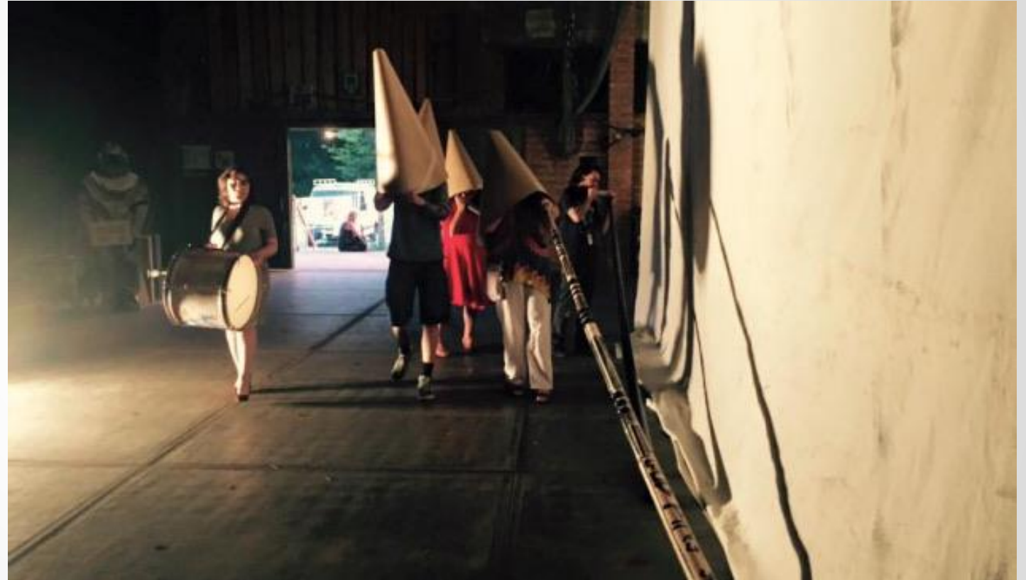
The Ostend Street Orchestra (TOSO, Klein Verhaal)

first training and research centre in social music worldwide