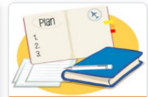
Planning of teaching