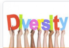
Diversity of learning and teaching