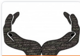
Values, Virtues, and Strengths