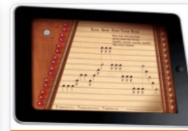
The tools of music teaching