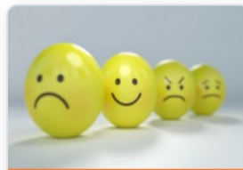
Emotional skills in teaching