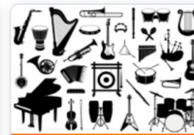
Instrument Task 1