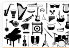
Instrument task 3