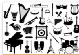
Instrument task 2