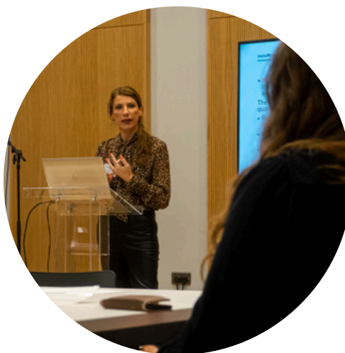
Table discussions were held where participants explored how to implement inclusive strategies. By the end of the session, participants had a deeper understanding of the inclusion challenges, and gained insights into the specific needs and barriers faced by these students which could apply to their own institutions.

In this collaborative workshop participants also learnt about existing resources and best practices, including mindfulness techniques, one of the modules included in the training course developed within the scope of the IncluMusic project (2022-2025), which is gathering a full range of materials and considerations that can enhance the support provided to students with SEN.