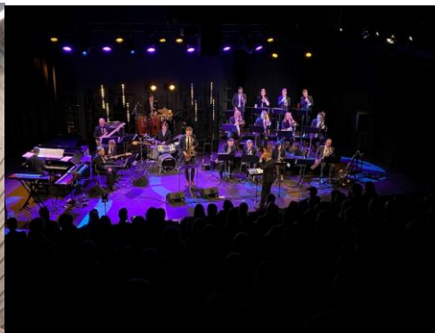
Metropolia Music Degree organizes concerts in Arabia Hall throughout the school year. Metropolia Big Band

Metropolia's Arabia Culture Campus is a vibrant urban arena for ideas and stories. The campus attracts creative minds from diverse cultural fields, continuing the district's long tradition of arts and design while boldly moving ahead in new directions. Metropolia's all operations of Culture and Arts are centralised in Arabia, Helsinki. Metropolia serves an important role as a prolific contributor to this heart of creative art in Helsinki. The Arabia region has a long history of creativity and design companies in Finland.