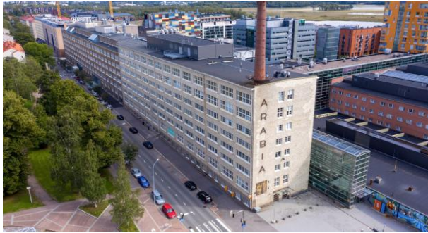
Metropolia UAS Arabia Campus

The AEC Pop and Jazz Platform 2026 will be held on Arabia Campus in Metropolia University of Applied Sciences, Helsinki. The address of the main location, Arabia Campus, Luova building, is Hämeentie 135 D, 00560 Helsinki . Part of the program of the event will be held also in the Music Building Soiva , address Muotoilijankatu 1, 00560 Helsinki , located right next to the Luova building.