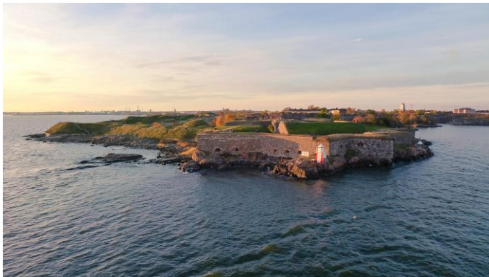
Fortress of Suomenlinna

Fortress of Suomenlinna - Unesco cultural heritage site