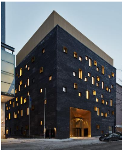
Metropolia UAS Music Building Soiva

The AEC Pop and Jazz Platform 2026 will be held on Arabia Campus in Metropolia University of Applied Sciences, Helsinki. The address of the main location, Arabia Campus, Luova building, is Hämeentie 135 D, 00560 Helsinki . Part of the program of the event will be held also in the Music Building Soiva , address Muotoilijankatu 1, 00560 Helsinki , located right next to the Luova building.