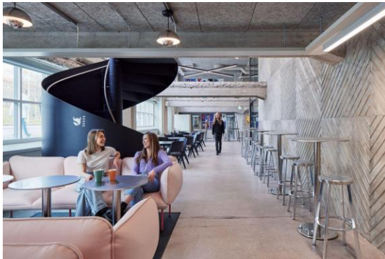
Arabia Campus METKA Cafe