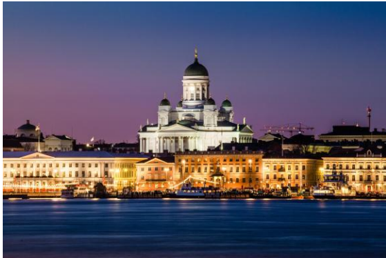
Helsinki seen from the Baltic Sea

The Helsinki region includes the capital city and its metropolitan area as well as some further-flung towns and cities. Here, nature trails and city life are both never more than a stone throw away, and the area is overflowing with good food, great design, interesting museums and unique architecture. Helsinki itself is an attractive and well-functioning city by the Baltic Sea, full of vitality. The City Strategy for Helsinki includes a goal to become the most sustainable tourist destination in the world and the city strives to be carbon-neutral in 2030. Culture is one of the driving forces of the city. Helsinki was chosen as one of the European Capitals of Culture in the year 2000. It is a home for all kinds of art forms and happenings. In the City Strategy culture and arts are seen as enablers of a good life.